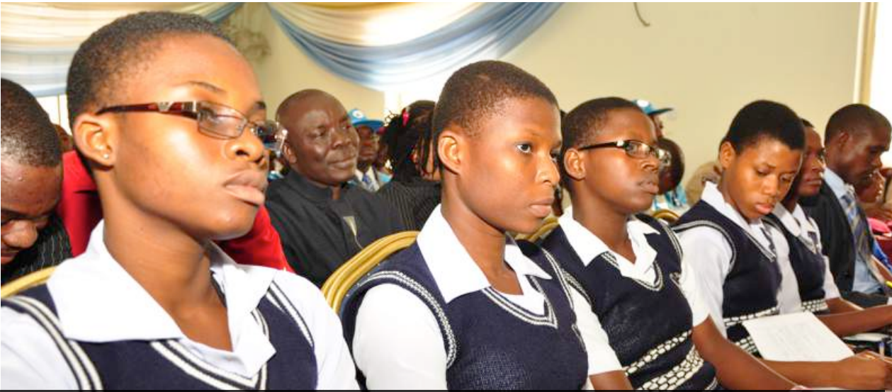
FRSC believes that inculcating a road safety culture at an early impressionable age would produce more disciplined adult road users. FRSC has 619 RSC in primary schools, 2,326 RSCs in secondary schools and 1,822 RSCs in the National Youth Service Corps programme.

In the United States, motor vehicle crashes are the primary cause of death for children from 2 to 14 years according to the Centers